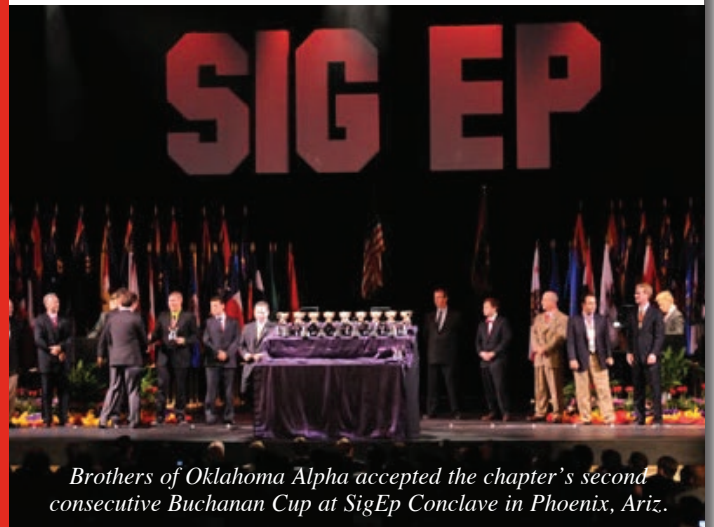
Brothers of Oklahoma Alpha accepted the chapter's second consecutive Buchanan Cup at SigEp Conclave in Phoenix, Ariz.