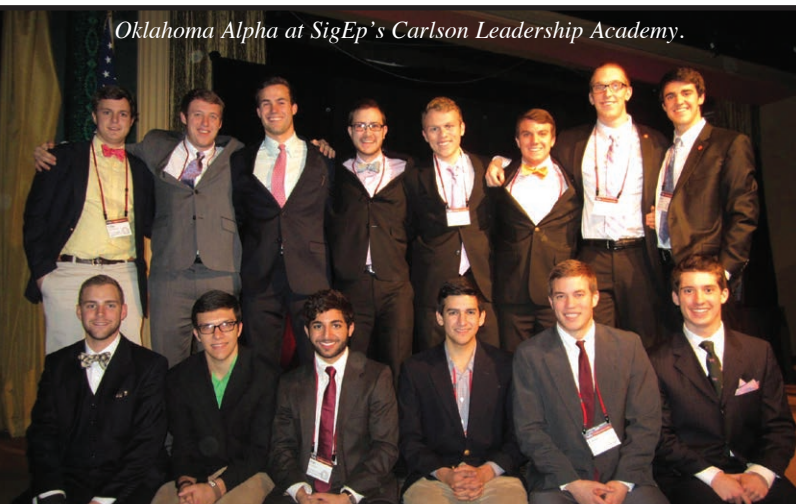
Oklahoma Alpha at SigEp's Carlson Leadership Academy.